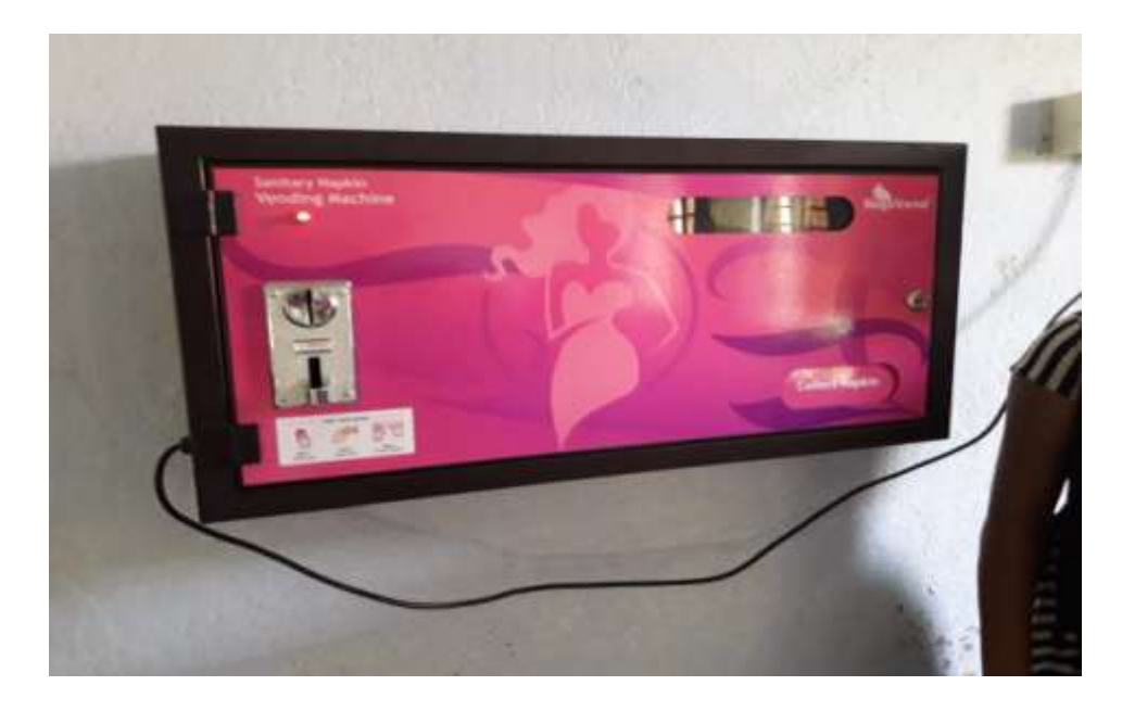
Installation of Sanitary Vending Machine inside girl's common room.