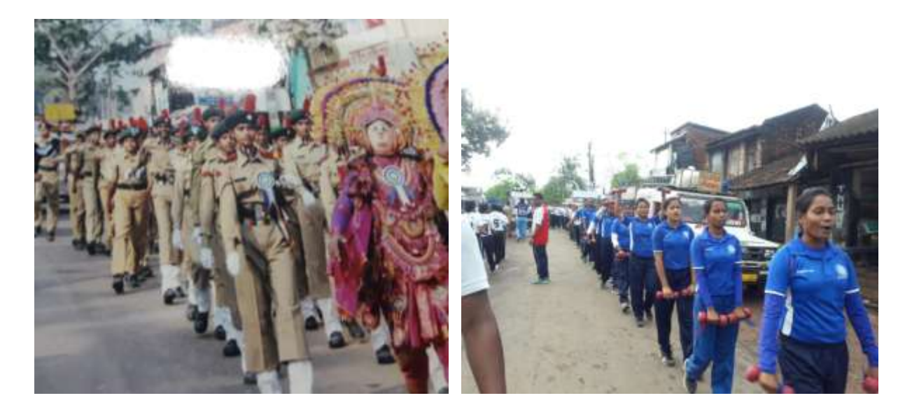
Girl students of this college in a parade