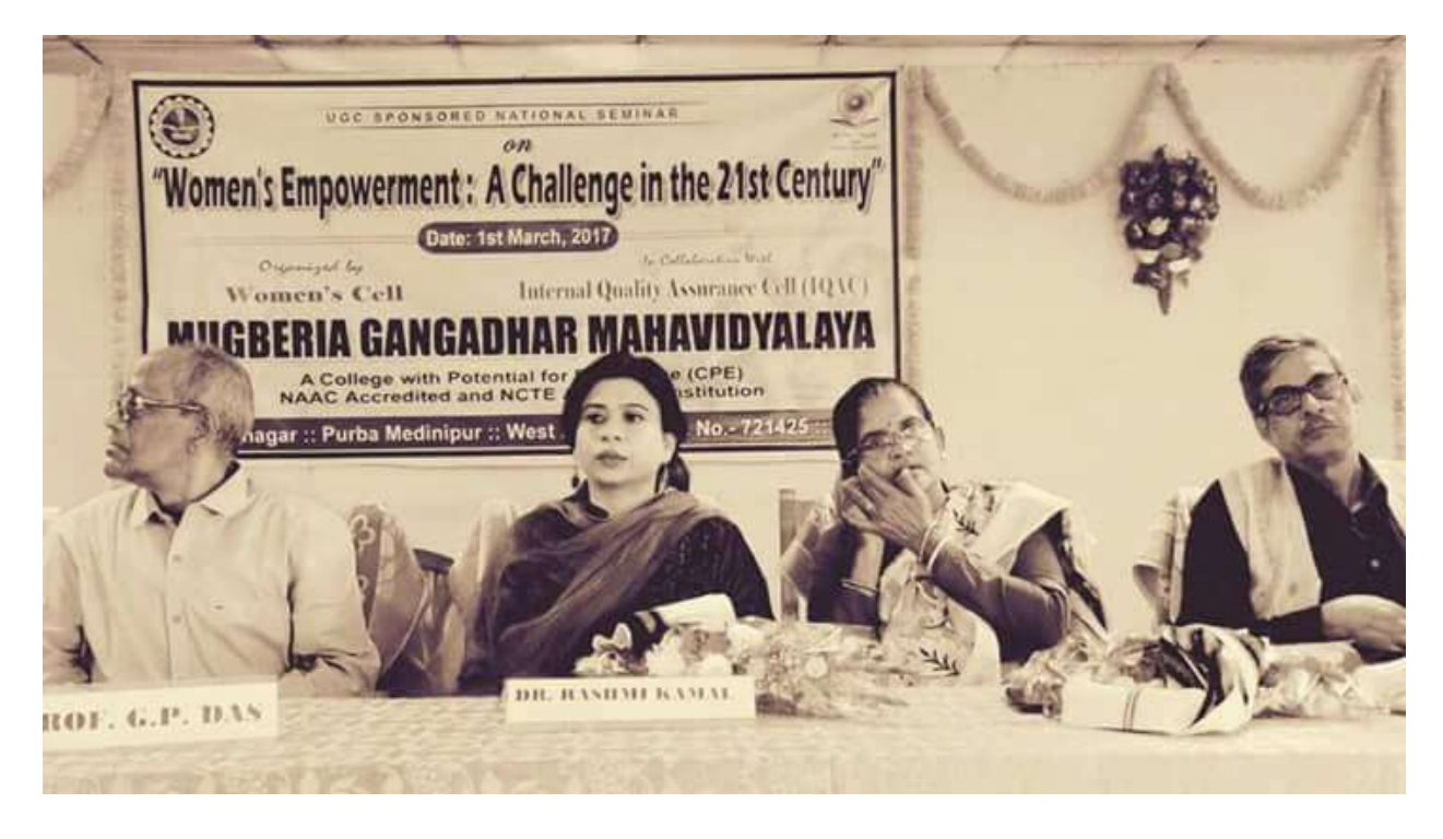
A national seminar organized by Women's cell in collaboration with IQAC